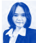
USA KHEMTHONG DISSERTATION TITLE: